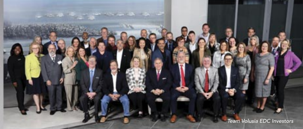
Team Volusia EDC Investors