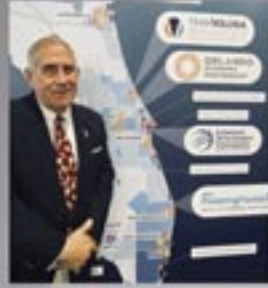
Farnborough Air Show