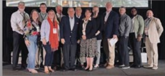
Area Development Consultants Fall Forum