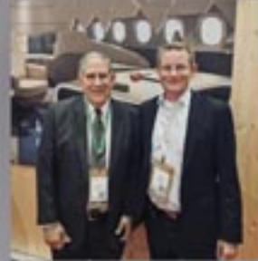
Aircraft Interiors Expo