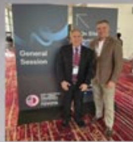
Joint Meeting of the Southeast U.S./Japan & Japan-U.S. SE Associations