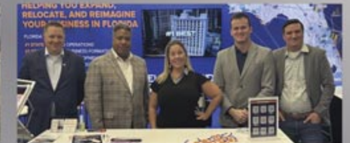
National Business Aviation Association Convention & Exhibition